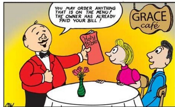
For no matter how many promises God has made, they are "Yes" in Christ. And so through him the "Amen" is spoken by us to the glory of God. - 2 CORINTHIANS 1:20 NIV

EH TTHA TSSPIHEED SIH RONIHGEB TSNNIHE: UTB EH TTHA THHA YRMEC NO EHT RPOO, YPPHA SI EH. OD YTHE TON RRE TTHA VSIEED VLIE? UTB YRMEC NDA UT- TRH SLLHA EB OT TMHE TTHA VSIEED OOGD